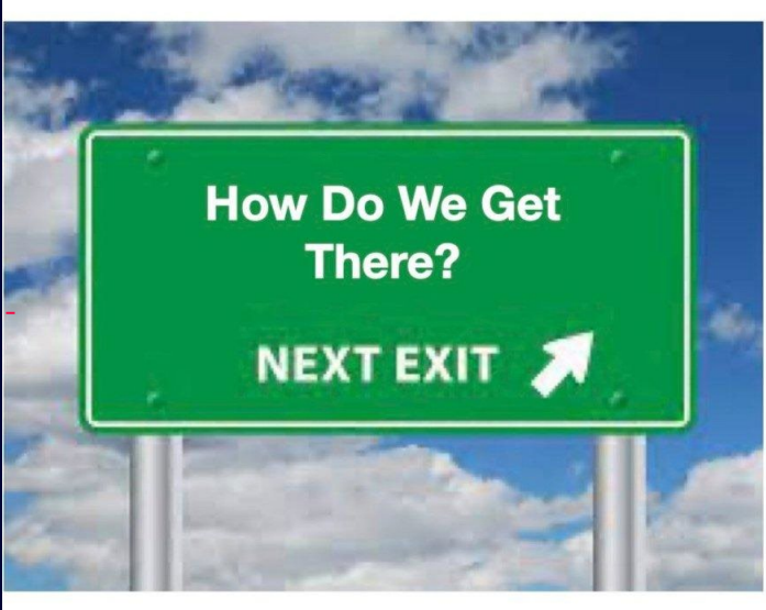
How do we get there?