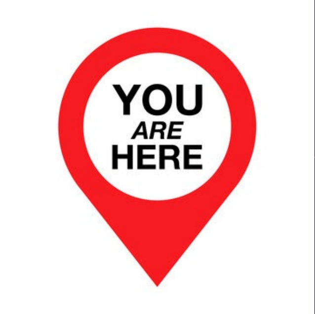
Where are you today?